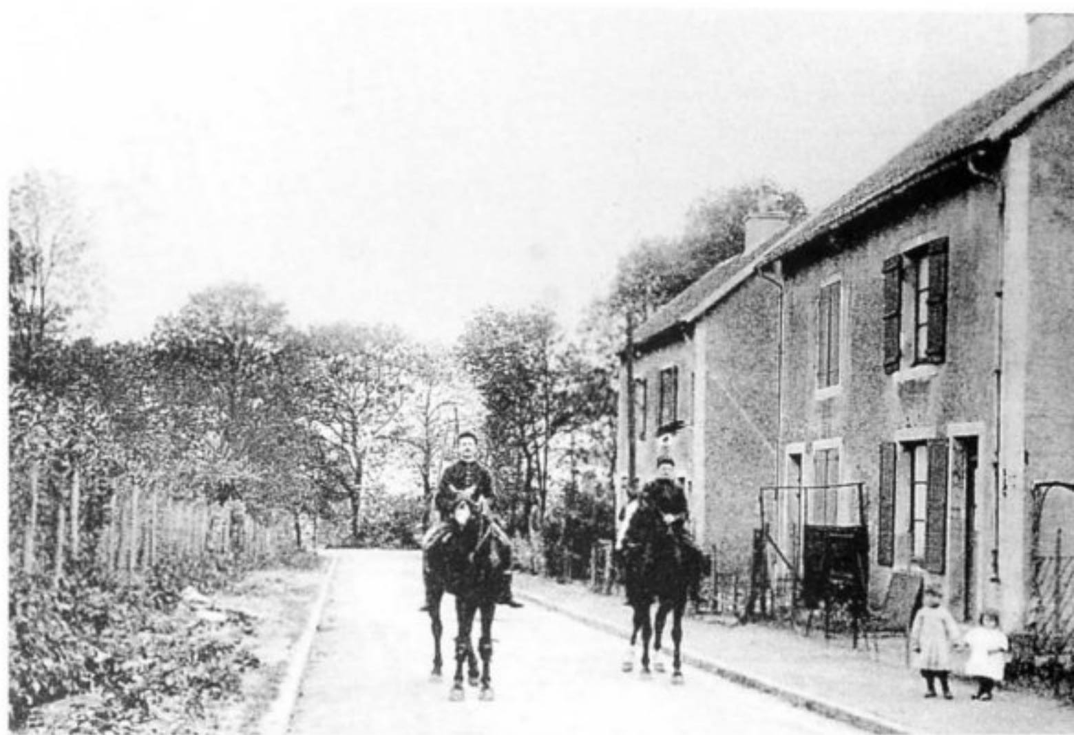
Le chemin du fort.