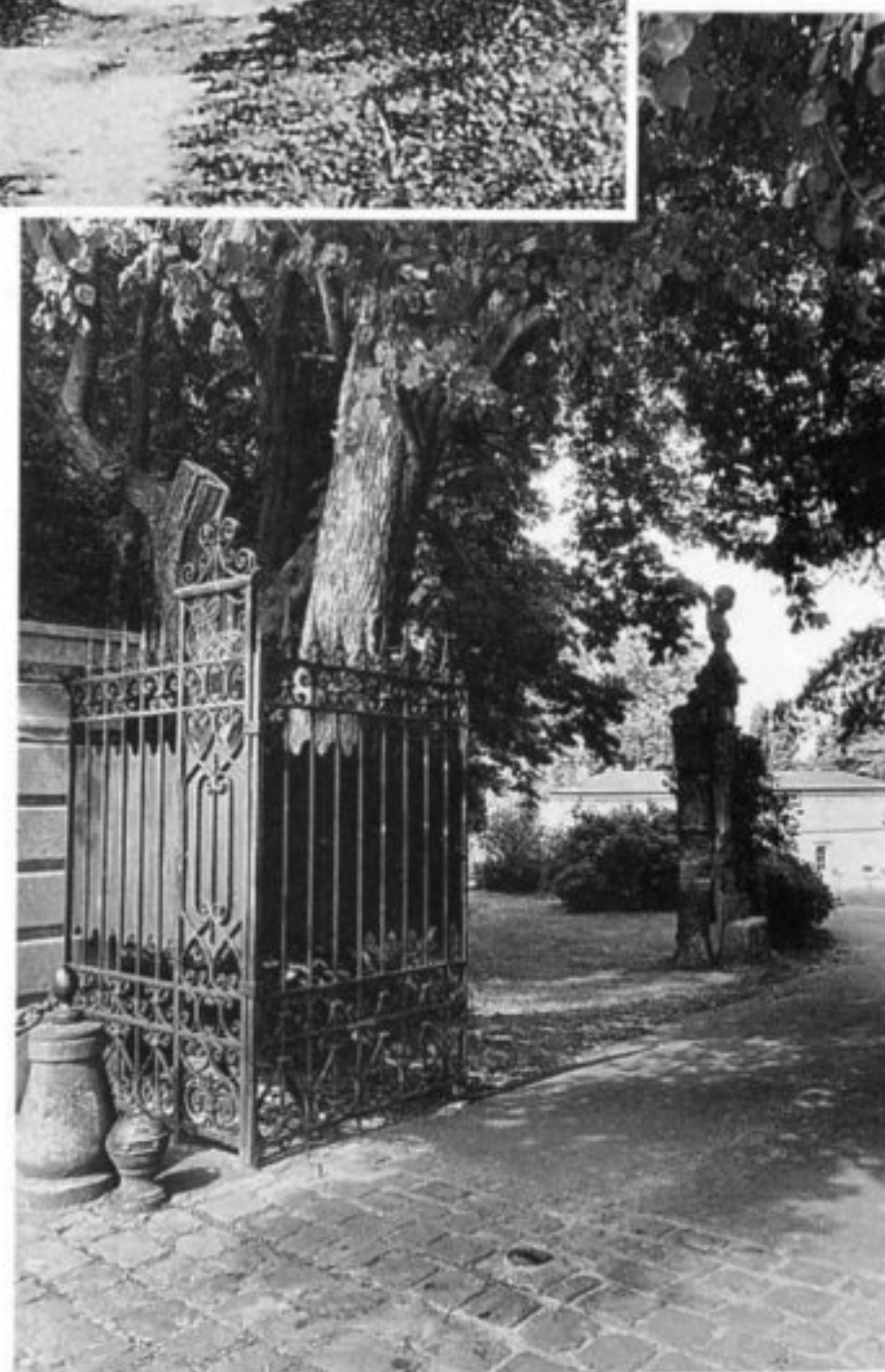
... et aujourd'hui.